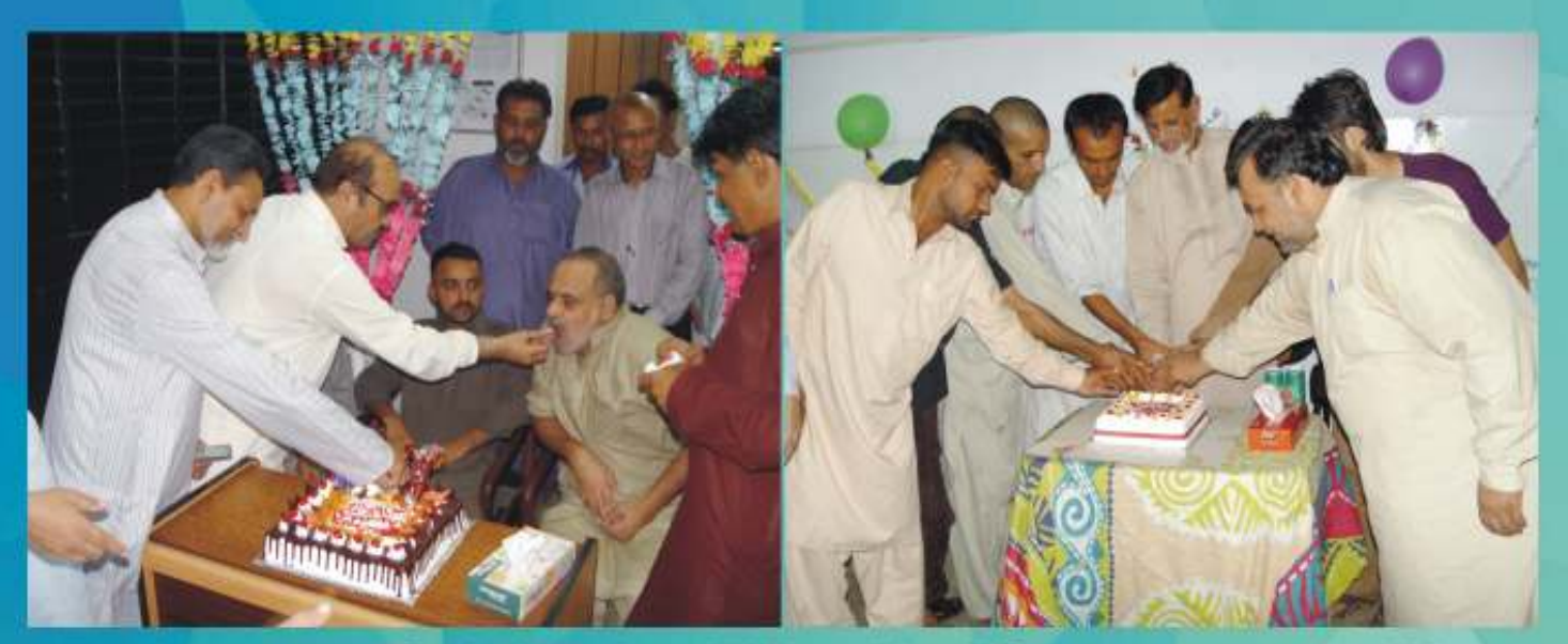
Patients are Celebrating EID with different personalities