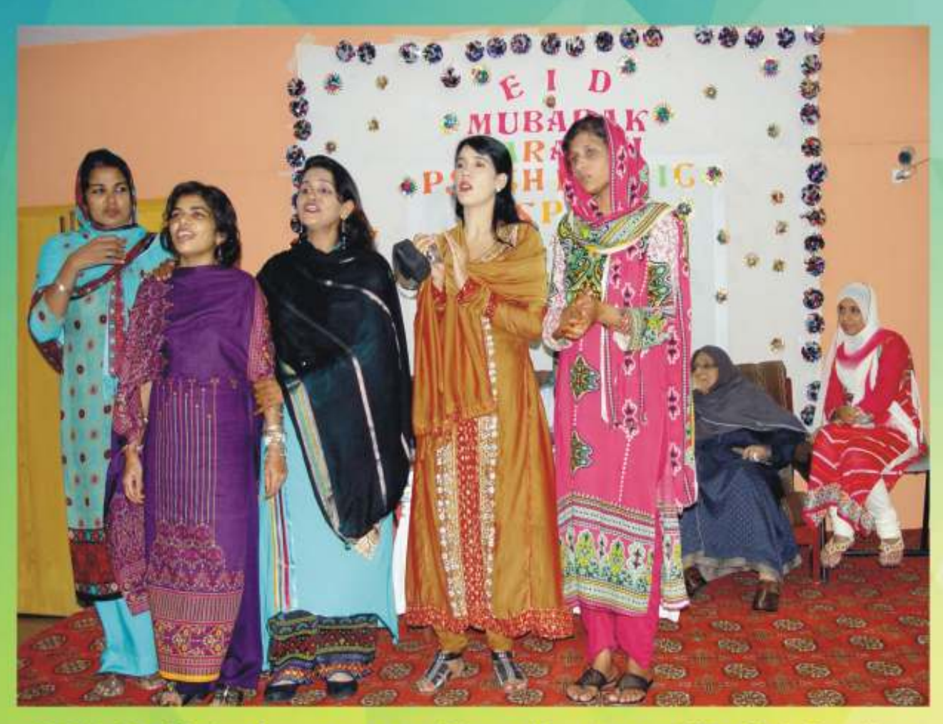
KPH Staff singing songs with patients on EID Celebration