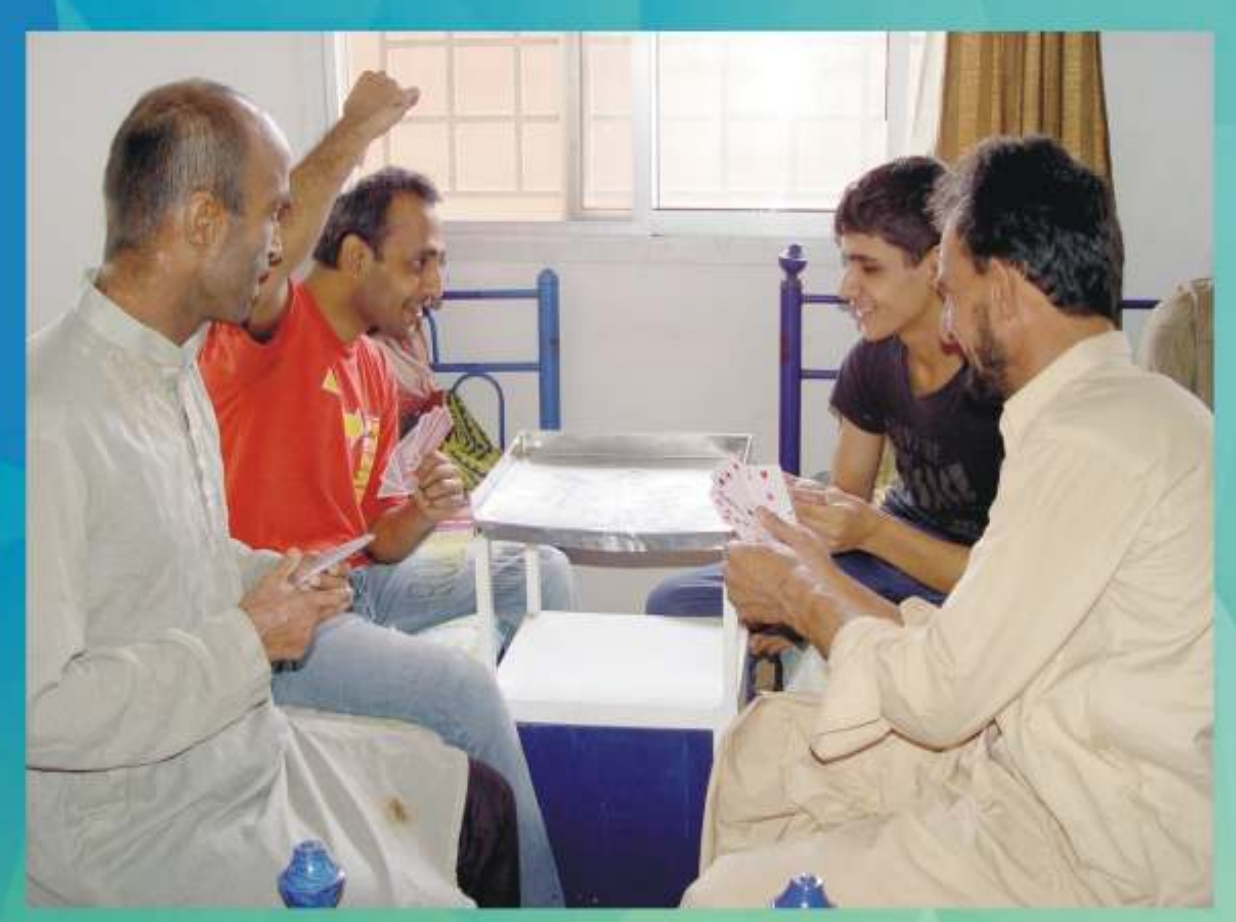
Patients are playing cards.